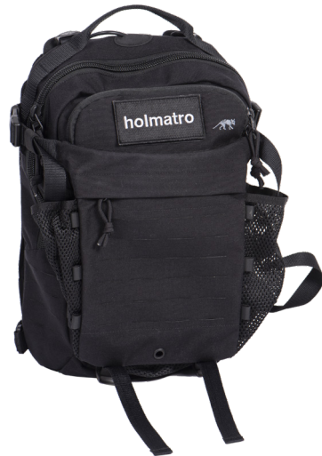
Backpack Pump GBP10EVO3