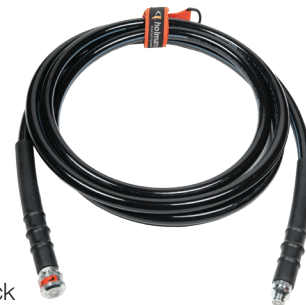
Hose Core 8' black