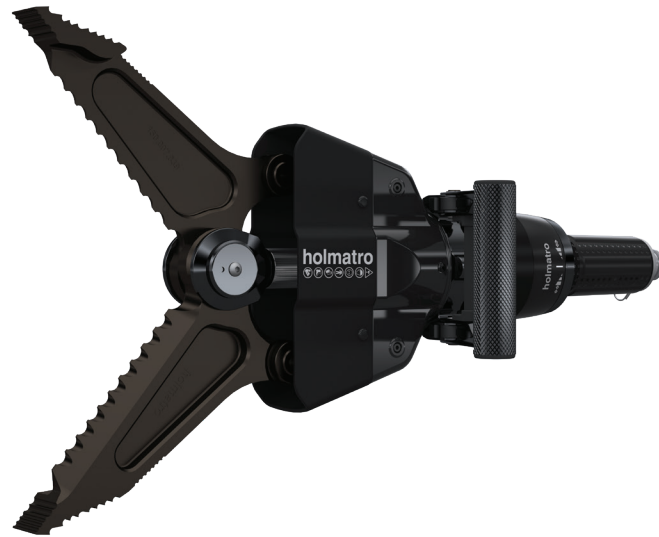
CT 5114 ST