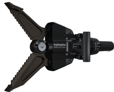
CT 5114 ST