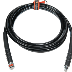
Hose CORE 6' Black (for specifications see page 23)