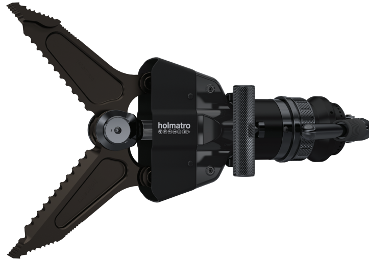
HCT 5114 ST