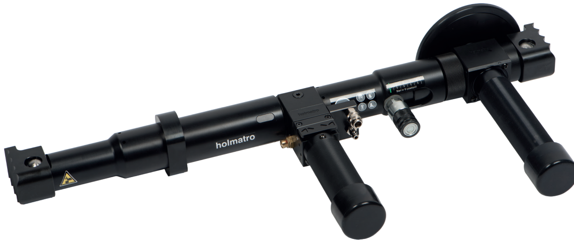
HDB 90 ST