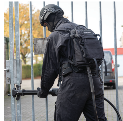
More information in brochure Lightweight Breaching Set

- Thanks to IP 54 rating: Protection against dust and splashing of water